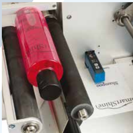
ALwrap with transparent label sensor

Key to this flexibility is its three roller application system, pinching the product accurately between two lower and one upper roller to ensure smooth and accurate rotation