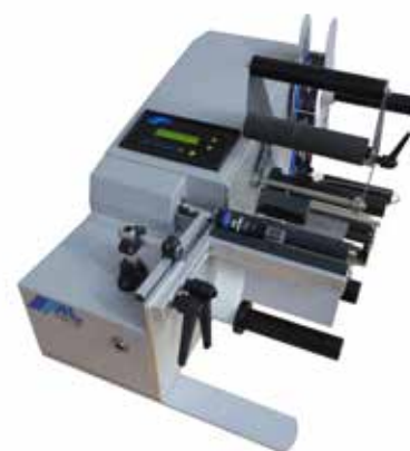
ALwrap with small bottles

ALwrap is extremely easy to load and operate; only rotating the product when the third roller unit is placed down on the product rather than rotating continuously like other machines which can make the machine difficult to load. Adjustment between products is completed by easy to move slide systems, with a typical label application speed of less than 2 seconds with most products.